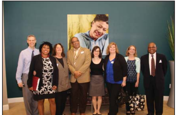
HUD officials pose under a picture of Ella Fitzgerald in the lobby of the Ella building during a recent tour of the Choice Neighborhood.