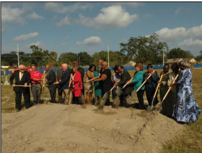
Members of the Reed family along with Tampa Housing Authority, HUD and local officials break ground on the Reed building.

Hopefully many of you saw the news in December that Tampa Housing Authority and its partners broke ground on not one, but two new affordable rental buildings at the Encore. The groundbreaking for the Trio was held December 4th. It will be the first building at the Encore available for families. The Reed groundbreaking was held December 18th and it will provide another high-quality, affordable housing option for seniors.