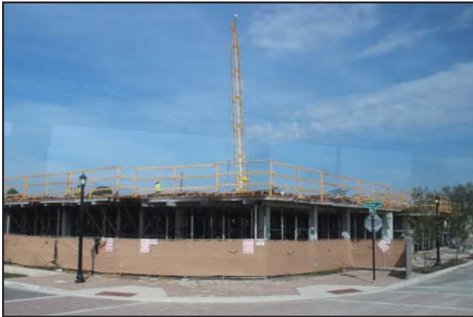
The Trio construction is on schedule. A quick drive by shows the first level of the buildings under construction.

The Tampa Housing Authority is one of four agencies to be awarded a 2012 Choice Neighborhood Implementation Grant from the U.S. Department of Housing and Urban Development. HUD made the announcement on December 13, 2012 that it will be awarding the Tampa Housing Authority and its partners $30 million dollars to help revitalize the Central Park Village and Ybor City neighborhoods. The funds will be used to build the Tempo, a new multi-family apartment building at the Encore, provide further supportive services to former Central Park residents, provide streetscape improvements along Scott Street, create an instructive urban farm on the Meacham School site, renovate Perry Harvey Park, and create a job training facility on land provided by GTE Federal Credit Union. The Grant will also extend case management services for families relocated from Central Park Village for another 5 years. For more information visit www.thafl.com/Choice-Neighborhoods .