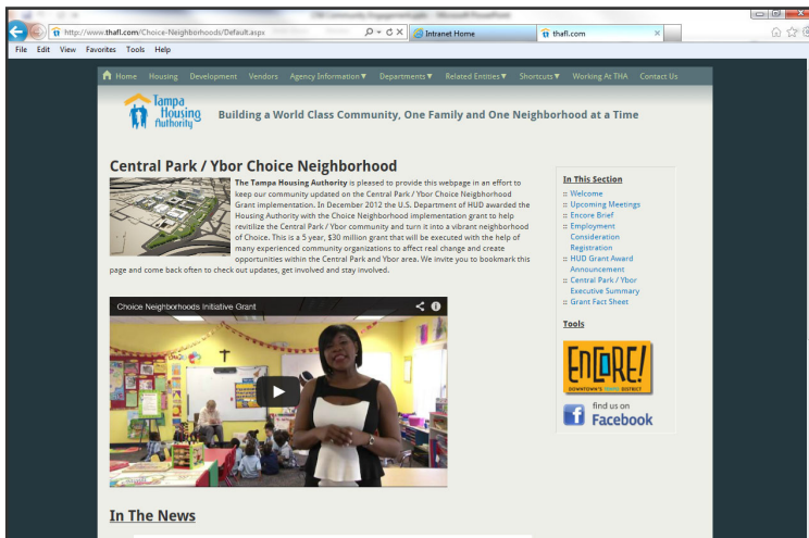
Please visit the Central Park / Ybor Choice Neighborhoods website for updates and information

http://www.thaft.com/Choice-Neighborhoods