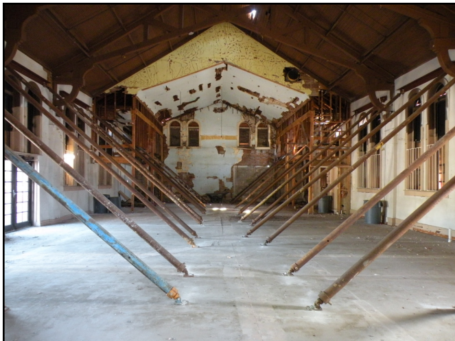
Currently the walls of the St. James Church are being shored with structural braces to prevent the building from collapsing.

HISTORIC ST. JAMES CHURCH Through the Central Park / Ybor Choice Neighborhoods grant, the Tampa Housing Authority received funds to help restore the historic St. James Episcopal Church located on the Encore site and turn it into a community services center. The church was built in 1921 and is the oldest and only remaining original structure on the Encore site. After the grant is completed the church will then be turned into Tampa's African-American history museum. The Tampa Housing Authority and its partner, Bank of America CDC, have chosen a historic preservation architect and will shortly request proposals from contractors qualified to perform restoration of historic structures. By the end of 2014 the St. James Church will be revived and ready to welcome former and new neighbors through its doors.