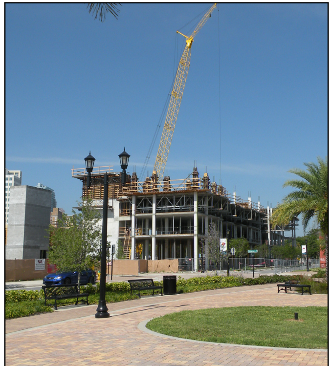
The construction of the Trio building is progressing on schedule!