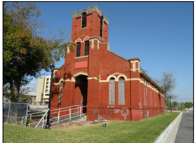
The historic 1921 St. James Church sits in the middle of the new Ray Charles Boulevard